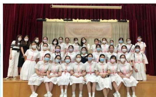
SRL 奧比斯學生大使 × 學生會 Talent Quest - Estrella