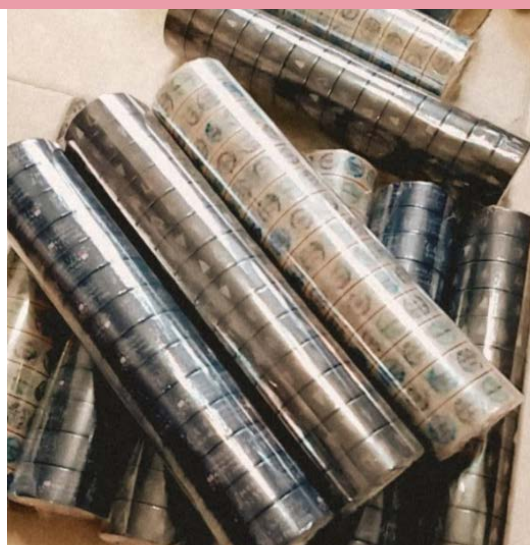
Christmas MTs Sale- 聖誕節快樂!