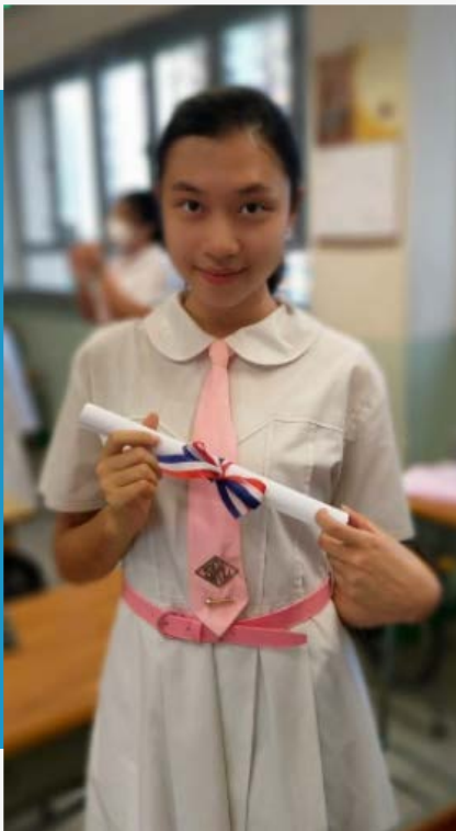
Today was Speech Day. Holding the certificate, I was ready to say good-bye to my secondary school life and welcome my university life with an open arm.

When braving the DSE, there will certainly be times of frustration and depression, especially when doing past papers. However, you are never hopeless. Plucking up your courage to face your anguish "over the possibility of performing badly", learning from your mistakes by marking them down and making sure you will not get them wrong again in exams and fighting hard for your goals by doing more and more exercises until you are totally familiar with them are what you should do. It is okay to fail, to cry, and to feel disappointed. The essential part is that you face them courageously and move forward!