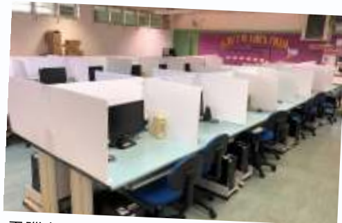
電腦室座位設有分隔板以增加學生社交距離，因其房間設置未能配合單向座位要求。