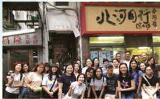
熱心的義工團隊，開工前，先來張大合照。