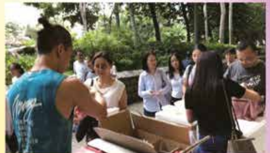
「北河同行」的義工們，協助分配飯盒。