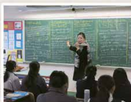
為教育大學有效教學研究作課堂錄影示範， 教授賞析 Lord of the Flies 的閱讀技巧和方法。