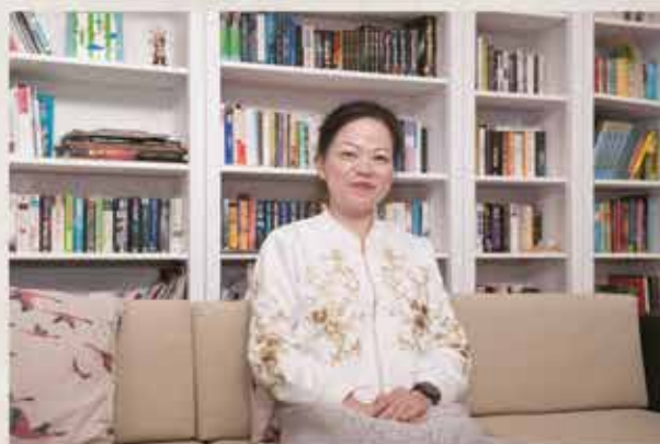
校長推介「悅」讀角 (Reading Corner)

在同學、家長和老師的共同努力下，本校 2018 年香港中學文憑考試之表現保持水準，絕大部分科目的成績均高於香港日校考生平均表現。四個主科的成績如下：